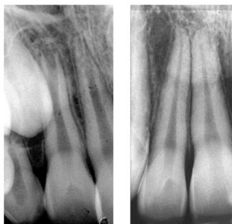
Figure 3 Pre- and post-treatment radiographs of a lateral incisor, which completed root development during the period of orthodontic treatment.

The next part of the study aimed to determine the effect of root elongation during treatment on final root length, and whether this length was different from that of teeth which were fully developed but may have suffered apical resorption during treatment. The results show that the younger teeth reach a greater final length, which is equal to the root length of untreated teeth, meaning that treatment did not have any negative